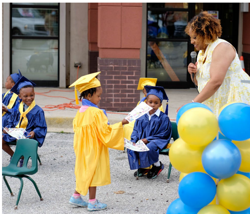
You are off to great places! Today is your day! Your mountain is waiting-so get on your way!